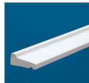
197 DRIP CAP