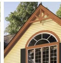
An accent color can work in complementary fashion.