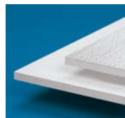
SHEETS SMOOTH / SMOOTH WOODGRAIN / SMOOTH