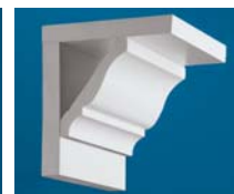
The use of crown moulding elevates any exterior trim application, creating a more formal look.