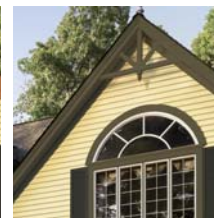
Choose a bolder accent to create striking contrasts.