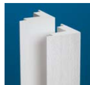
J-POCKET ONE-PIECE CORNERS FOR SIDING SMOOTH WOODGRAIN