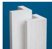
ONE-PIECE CORNERS SMOOTH WOODGRAIN