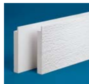
J-POCKET TRIMBOARDS FOR SIDING SMOOTH WOODGRAIN