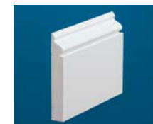
This trimboard accented with base cap shows no matter how simple the project, you can add detail and interest.

There's no limit to how Restoration Millwork profiles can be combined for unique looks.