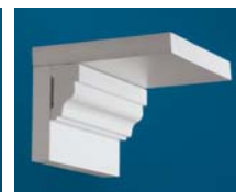
Dressing up cornice moulding can be as easy as detailing trimboards with rake.