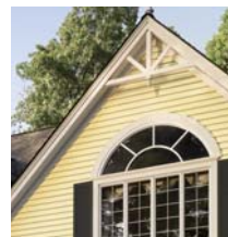
Similar colors give you a blended look.