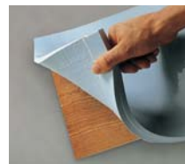
An impression from real cedar was applied to Restoration Millwork.